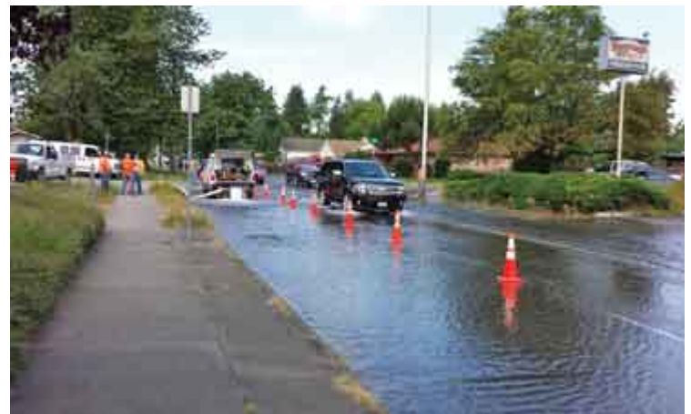
Limited stormwater conveyance and subsequent ponding may require traffic control beyond that required for operator safety.