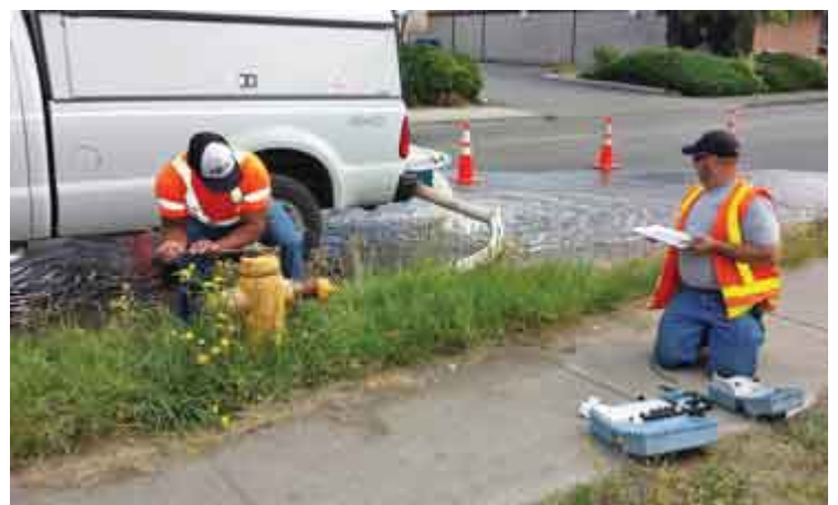
Visual inspection or measurements, such as turbidity, should always be used to confirm that water quality has been restored before ending the flushing sequence.

UDF mobilization and setup activities are similar to conventional flushing. Opening and closing of valves to support UDF will likely require a longer setup period; however, this time may be offset by shorter flushing duration of flushes. Several key mobilization and setup activities to consider are: