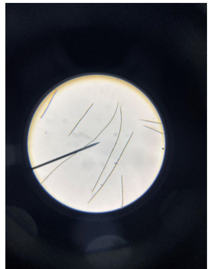
Dolichospermum sp cyanobacteria