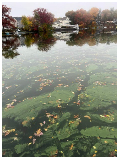
Surface scums in Half Moon Cove