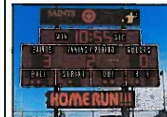
MESSAGE DISPLAYS & VIDEO

You may also be interested in these scoring accessories.