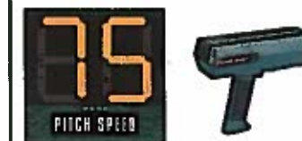
PITCH SPEED DISPLAY/RADAR GUN